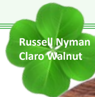
Russell Nyman Claro Walnut