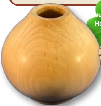
IoAnn Amberg Horse Chestnut