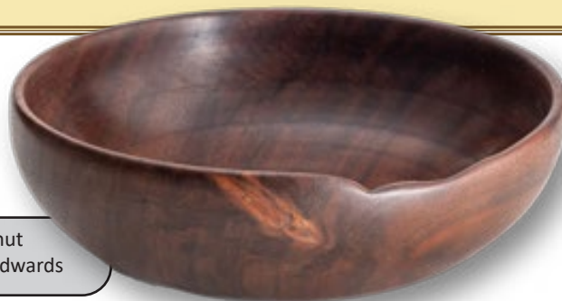
Walnut Suzette Edwards