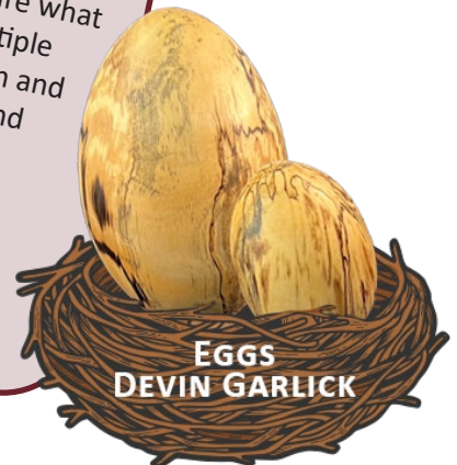
EGGS DEVIN GARLICK