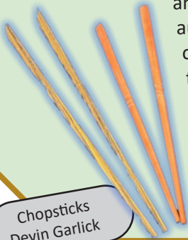
Chopsticks Devin Garlick

We're preparing for a wonderful picnic/wood auction on July 21. Our wonderful wood rat committee met on Saturday May 7th at Devin Garlick's house to cut up and prepare some of the wood that Devin is supplying for our wood auction. We will have maple, madrone, apple, birch, plum and some others. It's a wonderful opportunity to pick up some really great turning wood at some very good prices to support our wonderful club.