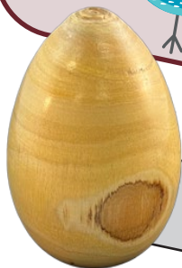
Eucalyptus Egg Bill Wells