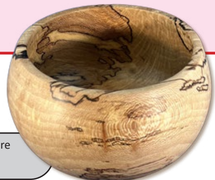
Spalted Sycamore Devin Garlick