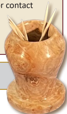
Maple Burl Toothpick Holder - Kathy Garlick