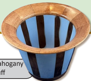
Walnut & Mahogany Ken Huff