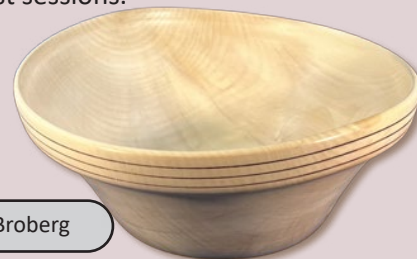
Bowl - Terry Broberg

You can either pay your dues at the meeting, or an even easier method is to do it online through the members only tab on the SPSW website at www.spswoodturners.org