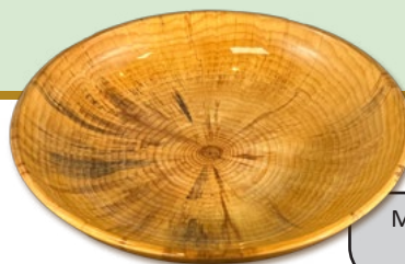
Monkey Puzzle Platter Pat McCart