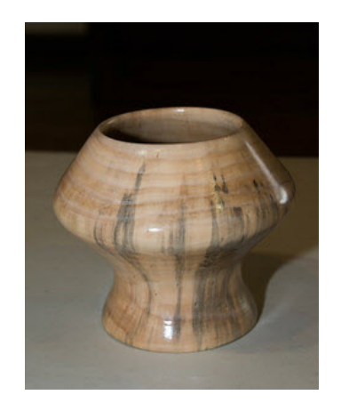
Be sure to visit http://avoided-artist.smugmug.com/Woodworking this month for many additional photos of Art Liestman's full day demonstration.