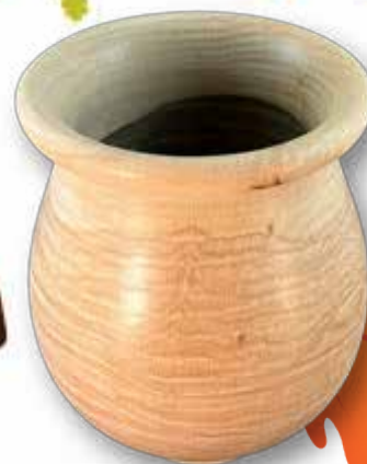
Ed White White Oak