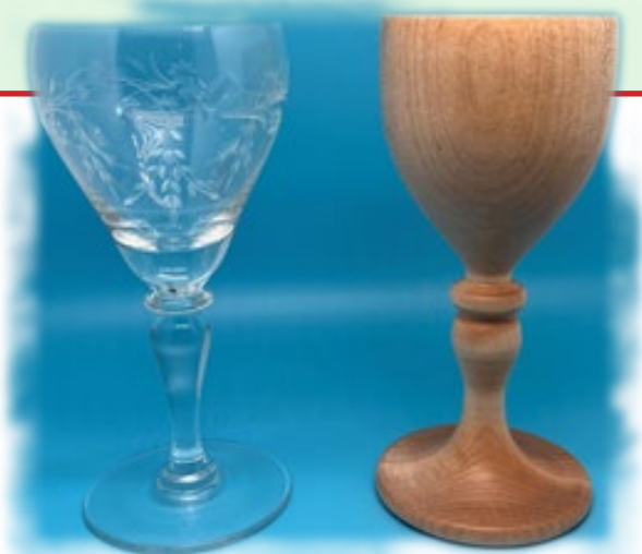
Duplicated Goblet Kent Horton