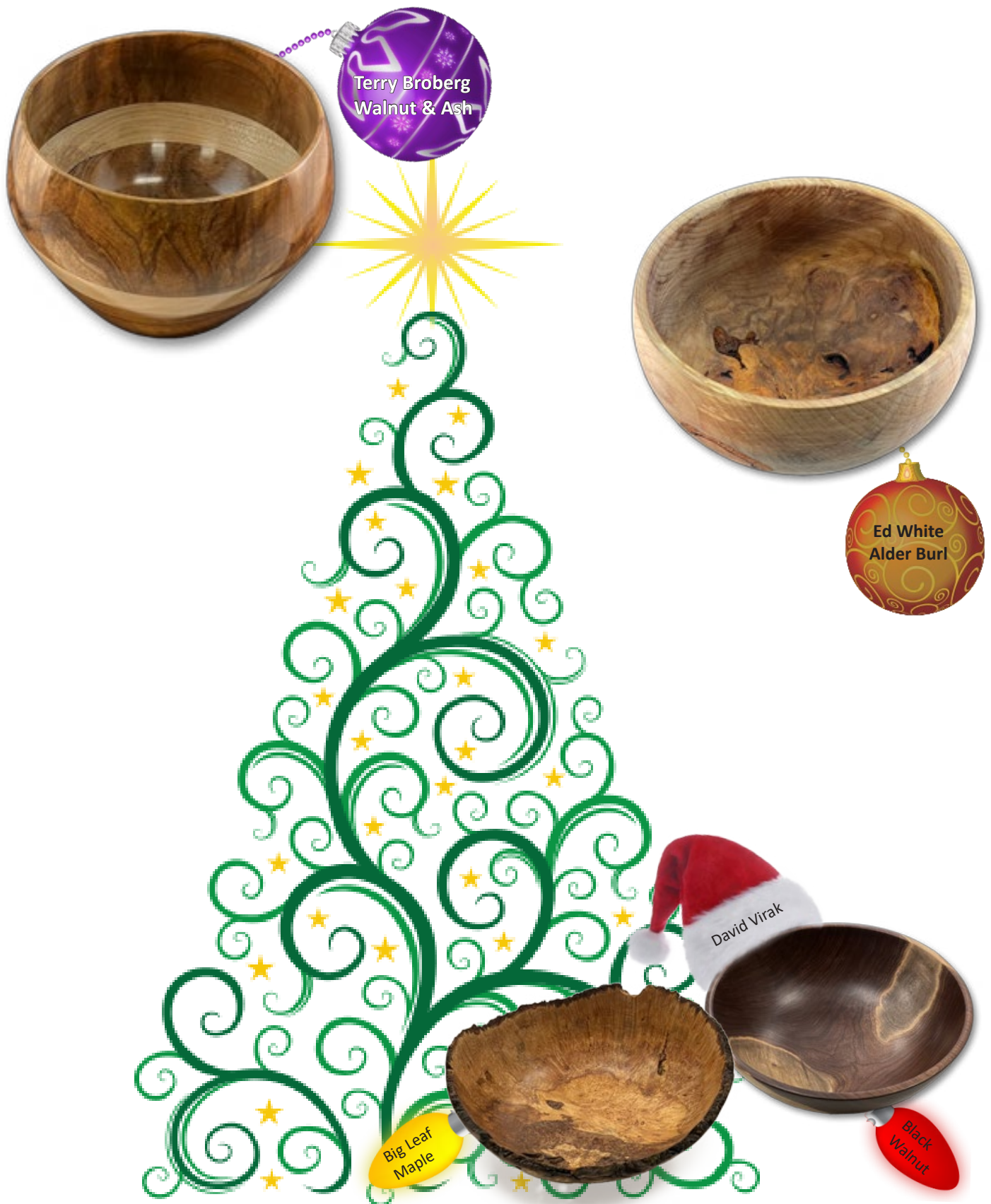
Terry Broberg Walnut & Ash