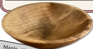
Maple - Wayne Wells