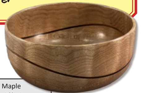
Maple Kent Horton