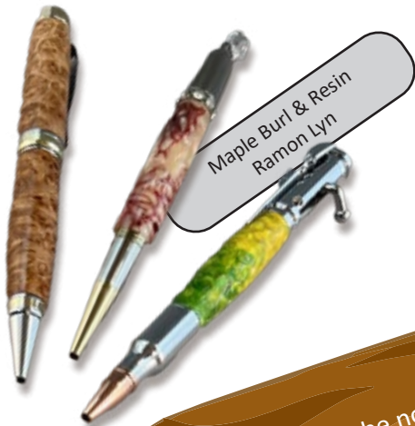
Maple Burl & Resin Ramon Lyn