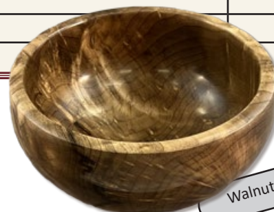
Walnut - Bob Sievers