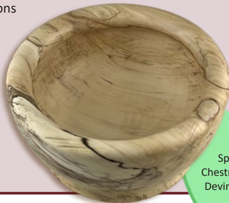
Spalted Chestnut Bowl Devin Garlick

You can either pay your dues at the meeting, or an even easier method is to do it online through the members only tab on the SPSW website at www.spswoodturners.org