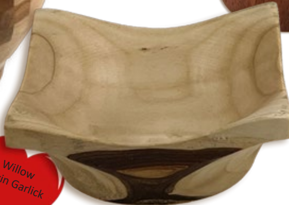
Willow Devin Garlick