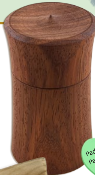
Padauk Box Pat McCart