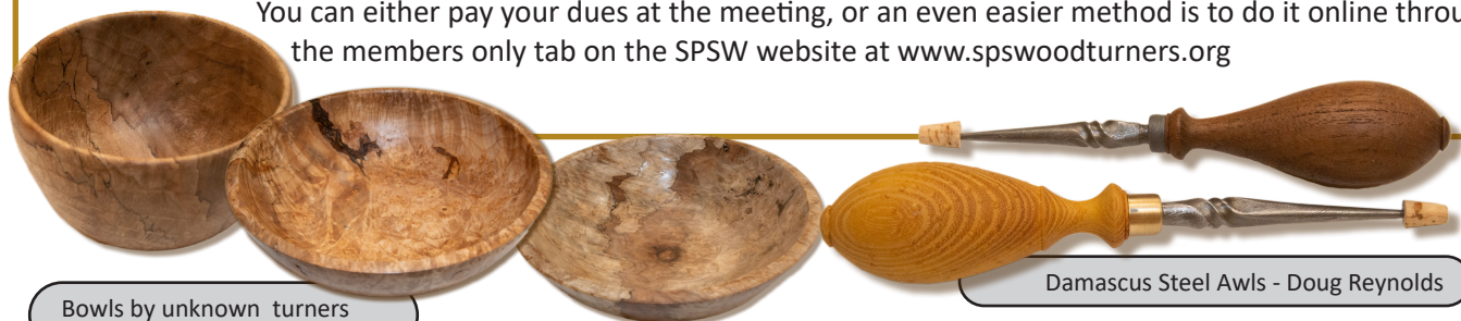
Bowls by unknown turners

You can either pay your dues at the meeting, or an even easier method is to do it online through the members only tab on the SPSW website at www.spswoodturners.org