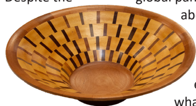
Segmented Bowl Unknown Turner