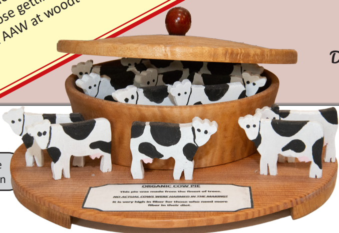
Cow Pie Unknown