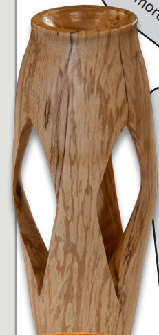
Inside Out Sycamore Vase