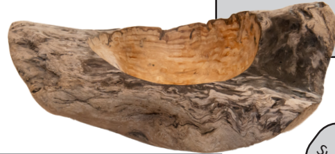
Driftwood - Alderwood Live Edge Bowl Don Mars

X Note: In house demos will be broadcast on Zoom from the Fife Center. DO NOT MISS OUT! Read the instructions on the next page.