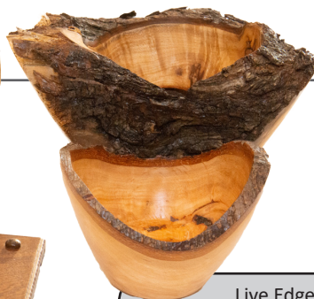
Live Edge Bowls - T Metcalf