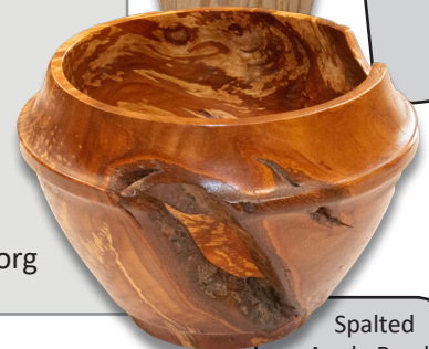
Spalted Apple Bowl