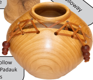
Cherry Hollow Form With Padauk Beads